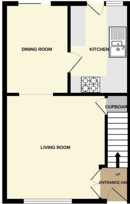
GROUND FLOOR 378 sq.ft. (35.2 sq.m.) approx.